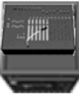
28DAYS IEM Rack